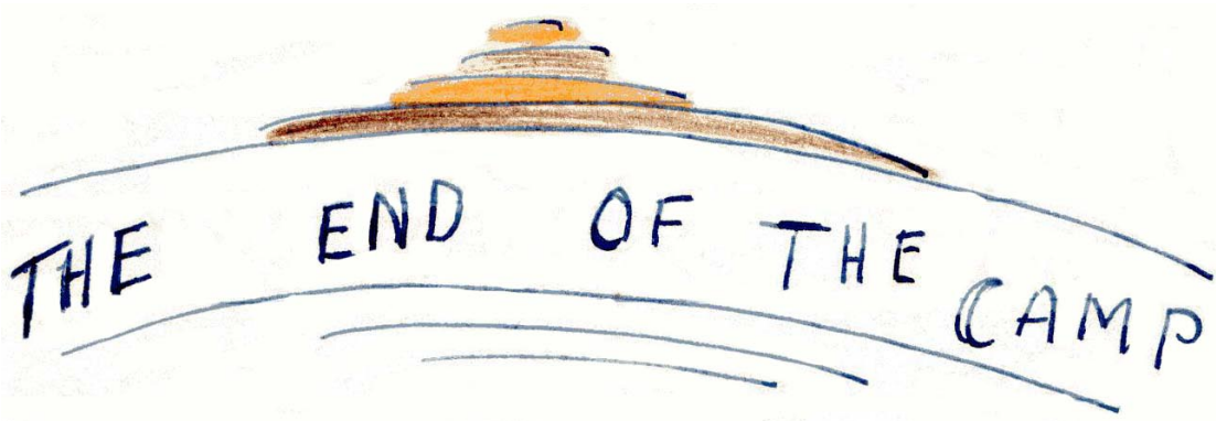
G. White (Second)